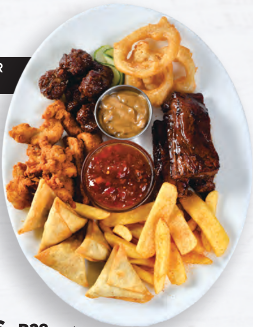
PLATTER FOR 2

300g Ribs, 4 chicken wings, crumbed mushrooms, vegetable spring rolls, 6 chicken nuggets and chips. Served with honey mustard and sweet chilli sauce