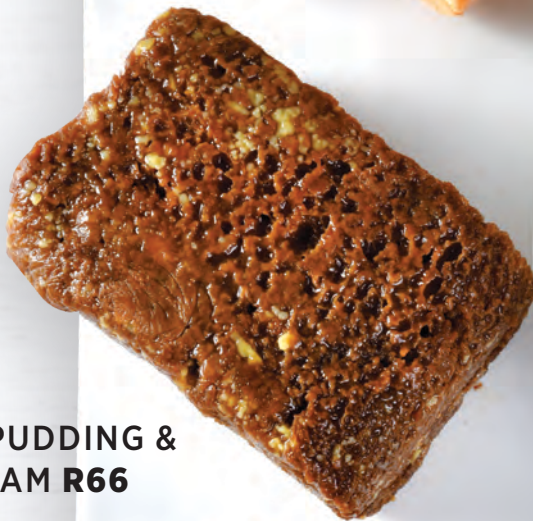
MALVA PUDDING & ICE-CREAM R66