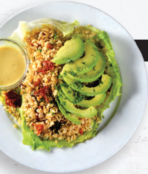
BROWN RICE SALAD

A brown rice mixed with onion, garlic, sundried tomatoes, almonds, black olives, fresh basil and parsley. Served on lettuce and with a wedge of lime and half an avo