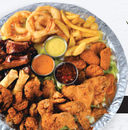
PLATTER DE LUX

Garlic, Mushroom, Cheese, Tartar, Sweet Chilli, Pepper, Honey Mustard Mayo