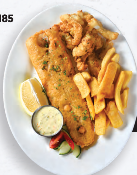
HAKE & CALAMARI COMBO