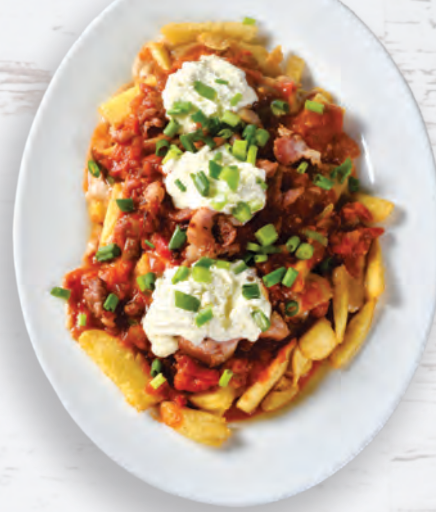
MCGUINNESS LOADED FRIES

Lambs liver braised in red wine, bacon, onion and gravy, served on a bed of potato mash