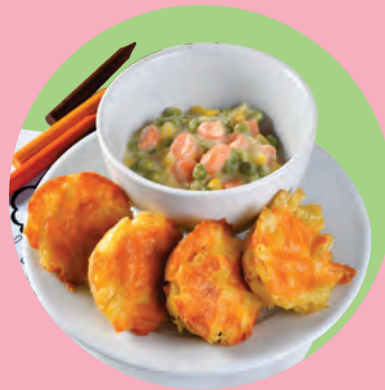
MAC AND CHEESE R76