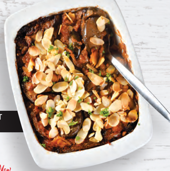
BRINJAL & COCONUT MILK BAKE