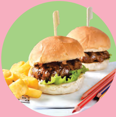
2 BEEF BURGER SLIDERS AND CHIPS R76