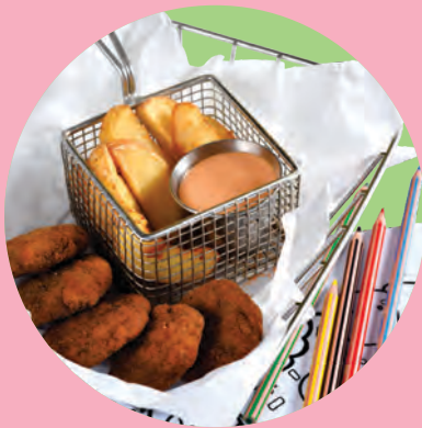
CHICKEN NUGGETS AND POTATO WEDGES R60