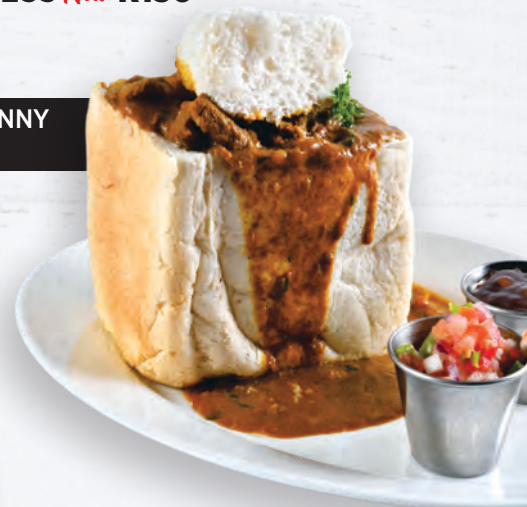
BEEF BUNNY CHOW