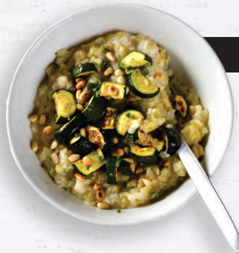
BABY MARROW RISOTTO

Baby marrow risotto topped with diced baby marrow, pine nuts and lemon zest