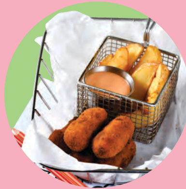
VEG NUGGETS AND POTATO WEDGES R70