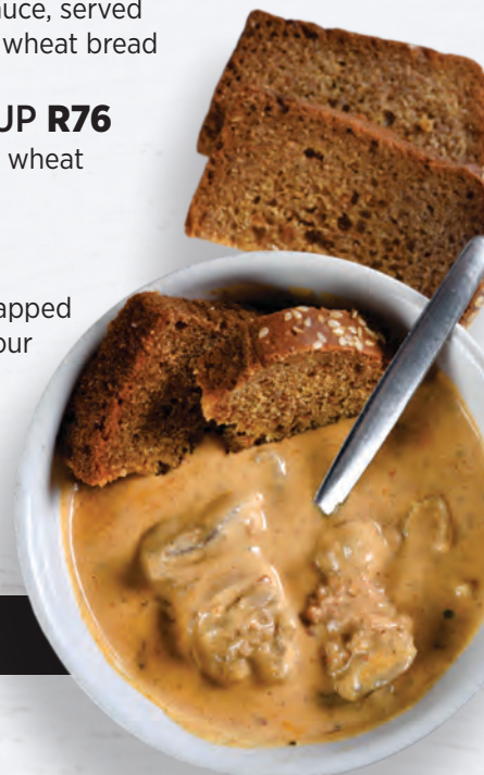
CHICKEN LIVERS PERI-PERI

Six little pork sausages wrapped in pastry and served with our homemade spicy mayo