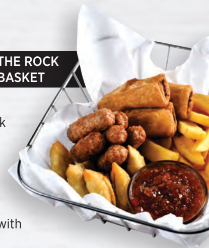
THE ROCK BASKET

Add a 500ml Castle Lite draught to any basket