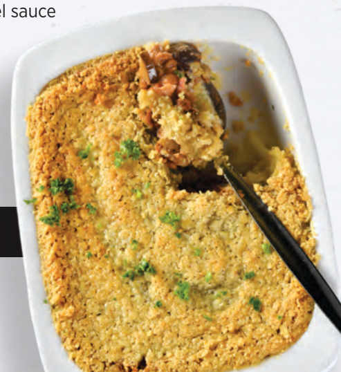
GREEK STYLE MOUSSAKA

Layered Brinjals and Lentil filling topped with a vegan Bechamel sauce