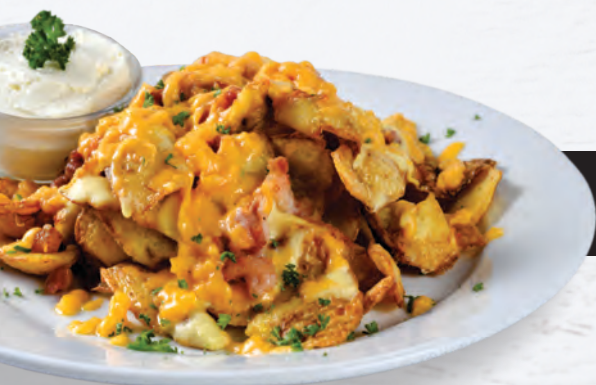
CHEESE AND BACON POTATO SKINS

Delicious deep-fried potato skins, covered with cheese sauce and bacon pieces and topped with melted cheddar cheese. Served with sour cream