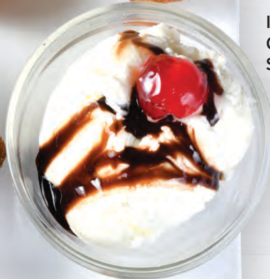
ICE-CREAM & CHOCOLATE SAUCE R47